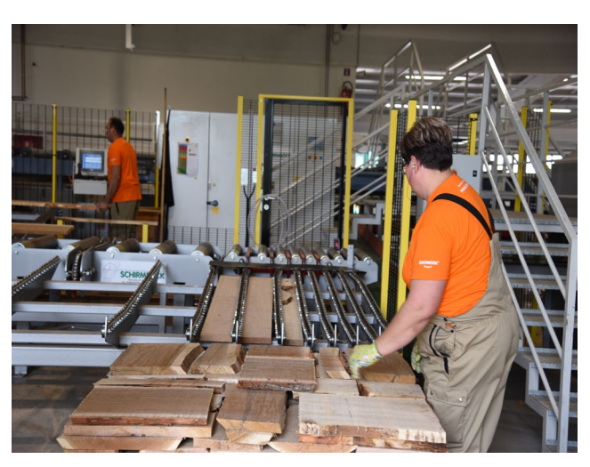
7) Over the past year, over 150 new employees have been hired and the plant now has more than 275 employees.