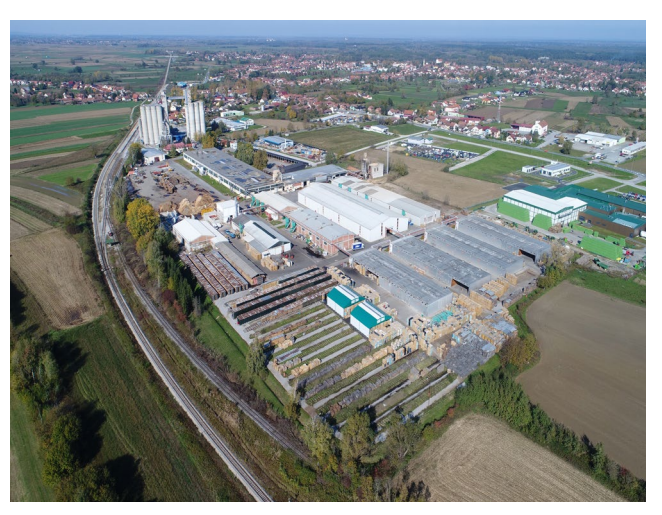
3) The 130'000 square meter large production area in Đurđevac, Croatia (view from above).