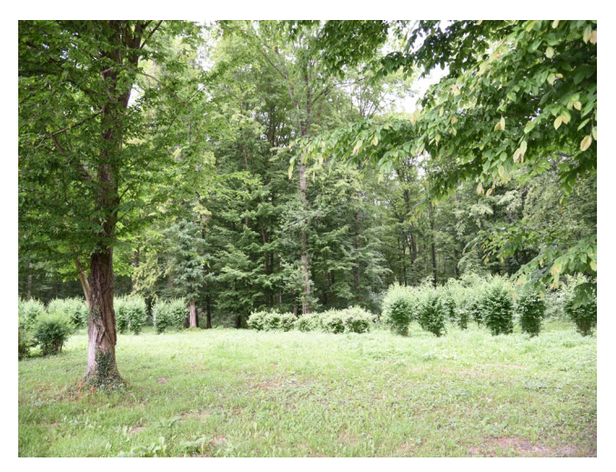
9) Repaš is 4.218 hectares large: Forestry is one of the most important economic activities in Croatia.