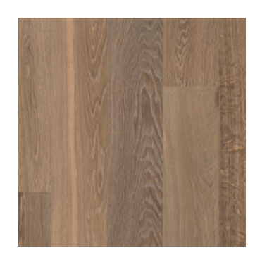
Oak Semi smoked white