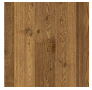
Oak Semi smoked