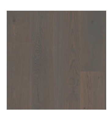
Oak Grey Pepper*